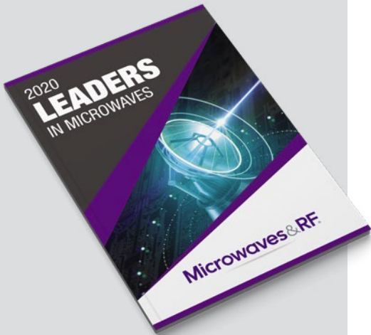
In 2020, Accumet was recognized as an industry leader by Microwaves and RF Magazine.